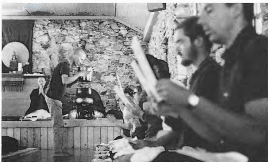
Oryoki at Tassajara, 1967

Sometime to use koromo to hide something underneath [laughs], when it is necessary. To use karma, you know, to help others, or to enjoy the karma without ignoring it. To enjoy our life—complicated life, difficult life—without ignoring it, and without being caught by it. Without suffer from it. That is actually what will happen to us after you practice zazen.