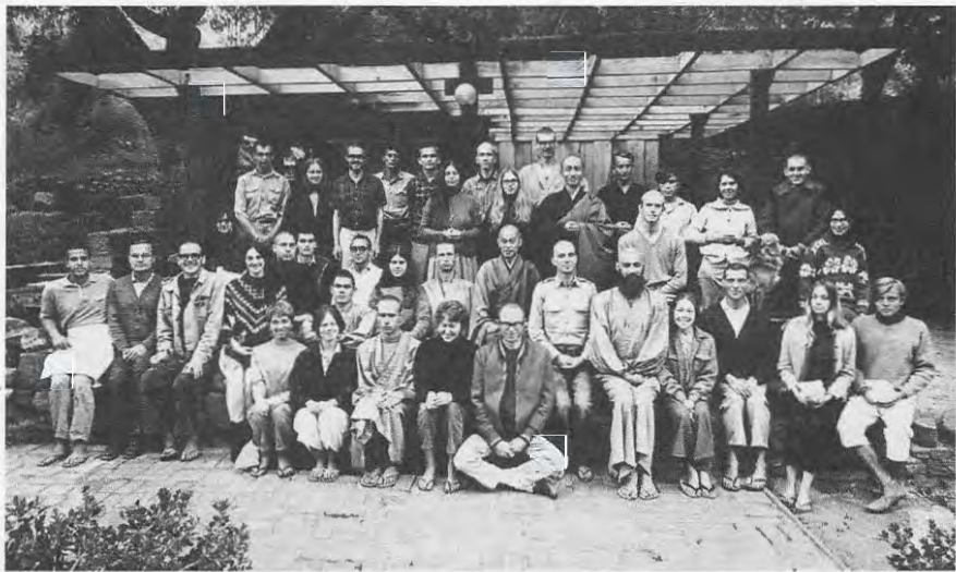
First Tassajara Practice Period Group, 1967

You may say water has its own nature and iron has its own nature, but that nature is conditioned by many con- [partial word: conditions?]—factors. That is why water is flowing, iron is hard. So, as Buddha said: “All constituent object are—has no self—self-nature.” The nature is—universal nature takes some particular way of function and under some condition. That’s all. So there is no such thing as self-nature.