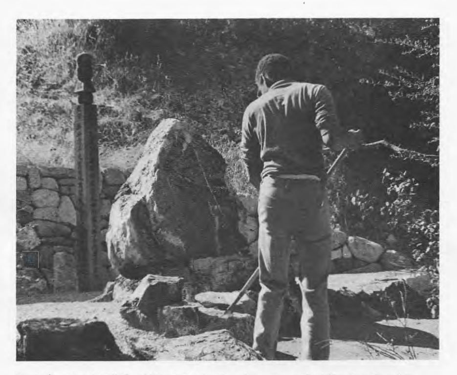
Every five days the Chiden (Altar Attendant) carries water up the hill to Suzuki-roshi's memorial, bathes the stone, waters the plants, offers flowers and incense, and rakes the sand.

and stainless"-ketsu, stainless. These two characters ko and ketsu are very interesting. I will explain later.