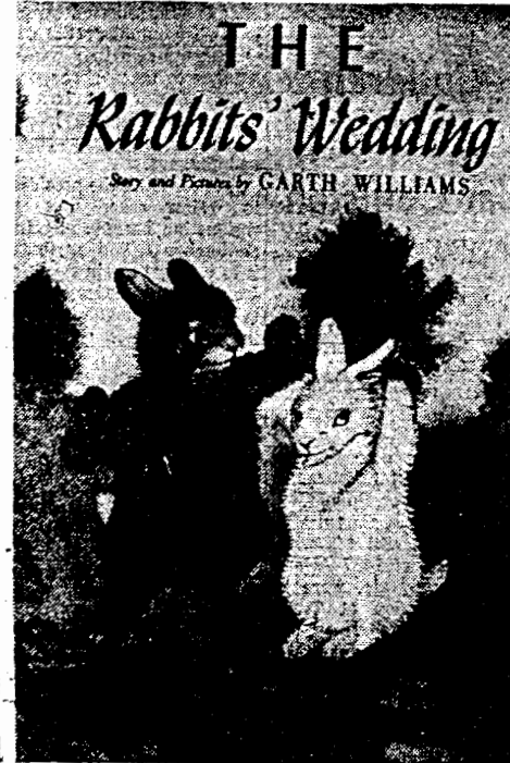
BRIDE AND GROOM BUNNY A racist sees only black and white