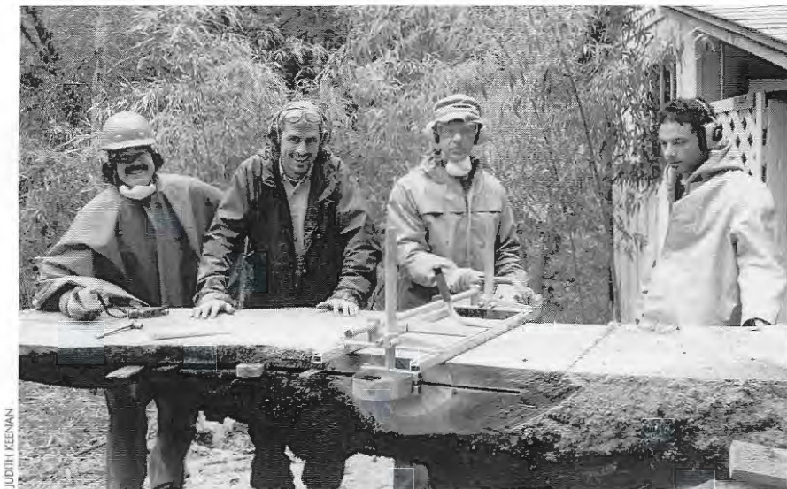
A work crew planes a fallen oak tree during the spring work period at Tassajara.

culminated in my coming back and completing the dharma transmission which I began twenty years ago.