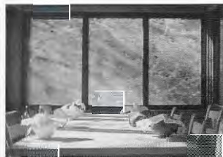
COVER: Oryoki bowls in the Tassajara dining room.