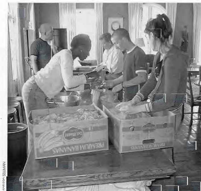
Volunteers in the Outreach program pack bag lunches for the homeless